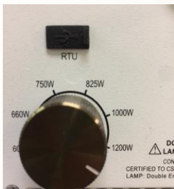
Windows NCCS Ballast (Only says "RTU")