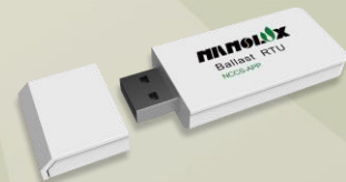
NCCS RTU APP