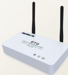
NCCS DTU APP