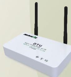
NCCS DTU APP